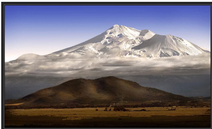
Digital by Virgil Lipscomb